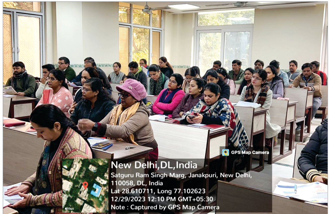
New Delhi, DL, India Satguru Ram Singh Marg, Janakpuri, New Delhi, 110058, DL, India Lat 28.610711, Long 77.102623 12/29/2023 12:10 PM GMT+05:30 Note : Captured by GPS Map Camera