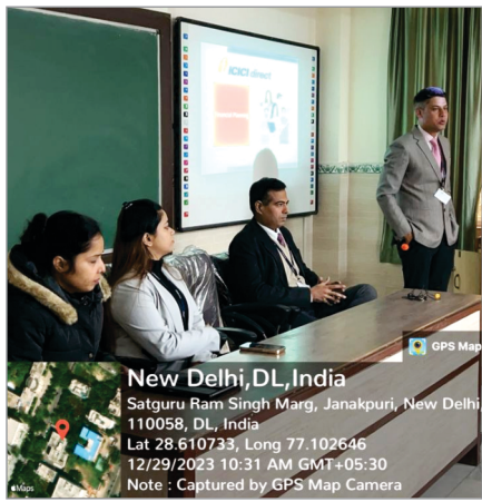
New Delhi, DL, India Satguru Ram Singh Marg, Janakpuri, New Delhi, 110058, DL, India Lat 28.610733, Long 77.102646 12/29/2023 10:31 AM GMT+05:30 Note : Captured by GPS Map Camera