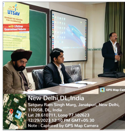
New Delhi, DL, India Satguru Ram Singh Marg, Janakpuri, New Delhi, 110058, DL, India Lat 28.610711, Long 77.102623 12/29/2023 12:10 PM GMT+05:30 Note : Captured by GPS Map Camera